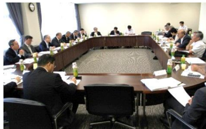
First Technical Advisory Chief Nuclear Officers (CNO) conference