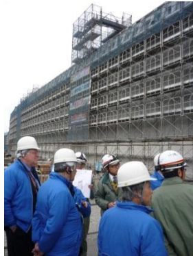
Visit to Hamaoka NPP (in front of the breakwater wall)